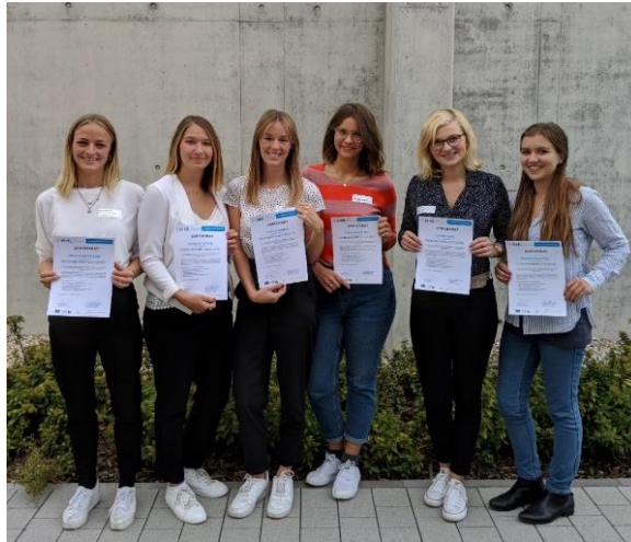
Our 4th class of female founders at the final pitch event in September 2019