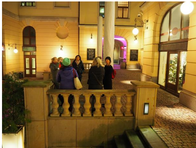
The female founders on their walking tour through Leipzig.

In every class, we also organize an event that brings the group together in a more casual way to strengthen the interpersonal relationships between our founders and our mentors. This year, we organized a walking tour through Leipzig, during which the participants learned about the history of Leipzig's women.