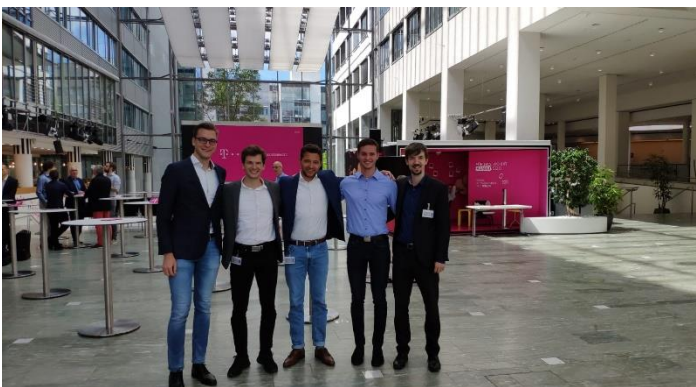
The students consulting team at the Telekom headoffice in Bonn