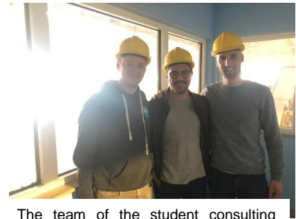
The team of the student consulting project twith Enviam (one person is missing)

In spring term 2019, HHL realized its first student consulting project with energy provider “ enviaM ”. As digitalization and the Internet of Energy are firmly embedded in the strategy of the East-German company and its parent company Innogy SE, the consulting support and expertise of HHL was highly appreciated. Four HHL students from MSc18 successfully analyzed the potential of the smart waste management market and came up with interesting business cases and possible market entry strategies. During the market analysis, the students identified several pain points, e.g. inefficient logistical processes as well as the wrongful mixing of different waste types. The results opened up a great number of opportunities for feasible business models like the collection of waste in underfloor containers. After the first successful cooperation of enviaM and HHL, we are looking forward to continue working together on future projects. HHL alumna Claudia Tänzer and the Chair of Innovation Management and Entrepreneurship supervised the project.